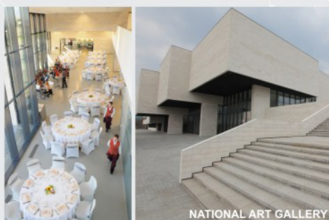
NATIONAL ART GALLERY